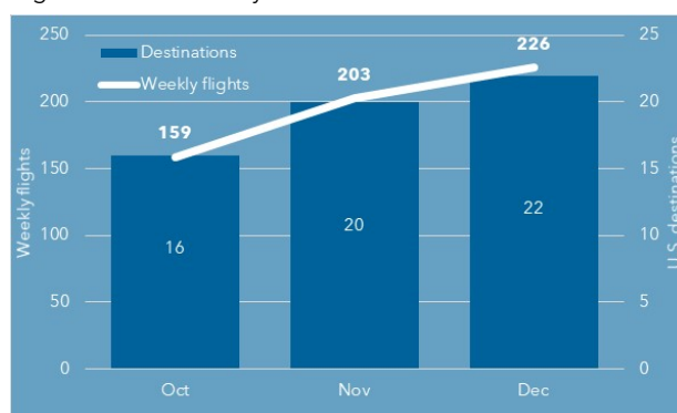
Figure 2: British Airways' U.S. network

These changes will increase weekly flights to the U.S. by 42% between October and December (Figure 2). The growth in available seat capacity could be much higher, as British Airways will also up-gauge some flights to Los Angeles and Miami to Airbus A380 operation.